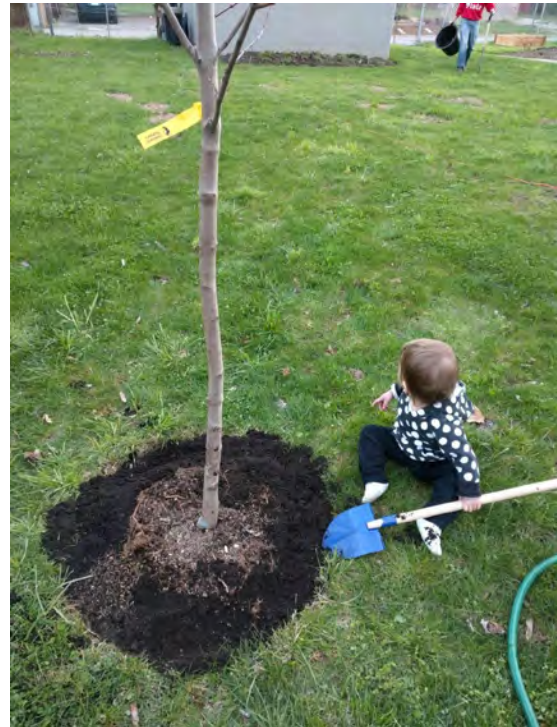
Involve your entire family in a tree planting project.

If the church or home is adjacent to or contains an urban forest or woods, connect the parish landscape with it. Maintain trees on church property, and if possible, mimic the nearby wooded property in the church landscape. Creating a corridor is essential for wildlife and bird migration and movement.